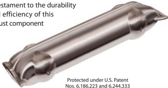
Protected under U.S. Patent Nos. 6,186,223 and 6,244,333