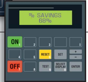
DPC™ - Standard on 1000-2400, optional on 150